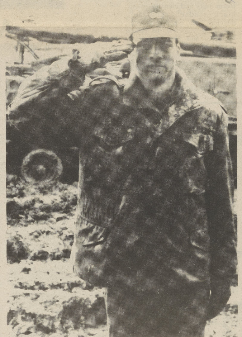
Knee-deep in mud and loving it.

Everyone who attended the trip had a super time, and all are eagerly waiting the next trip.