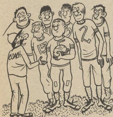
"Well, here we are — unbeaten, untied, unscored on, and going into our first game."