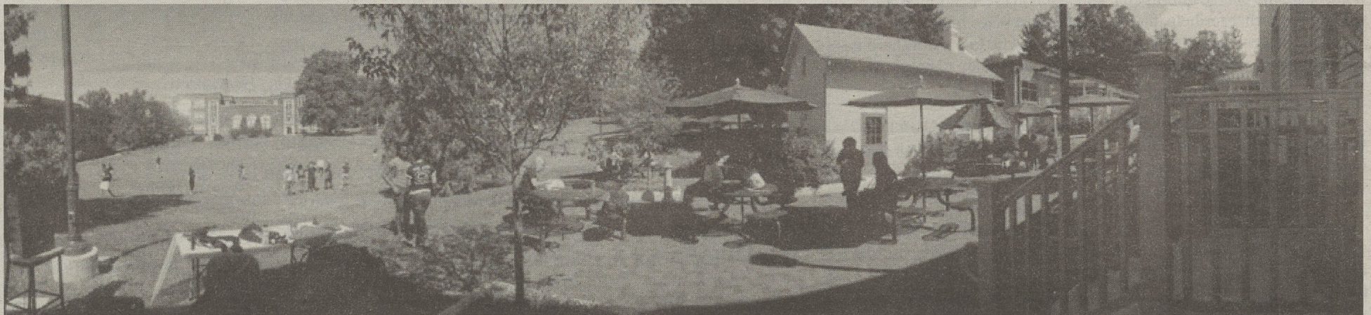
A panorama view of the Wiestling Student Center