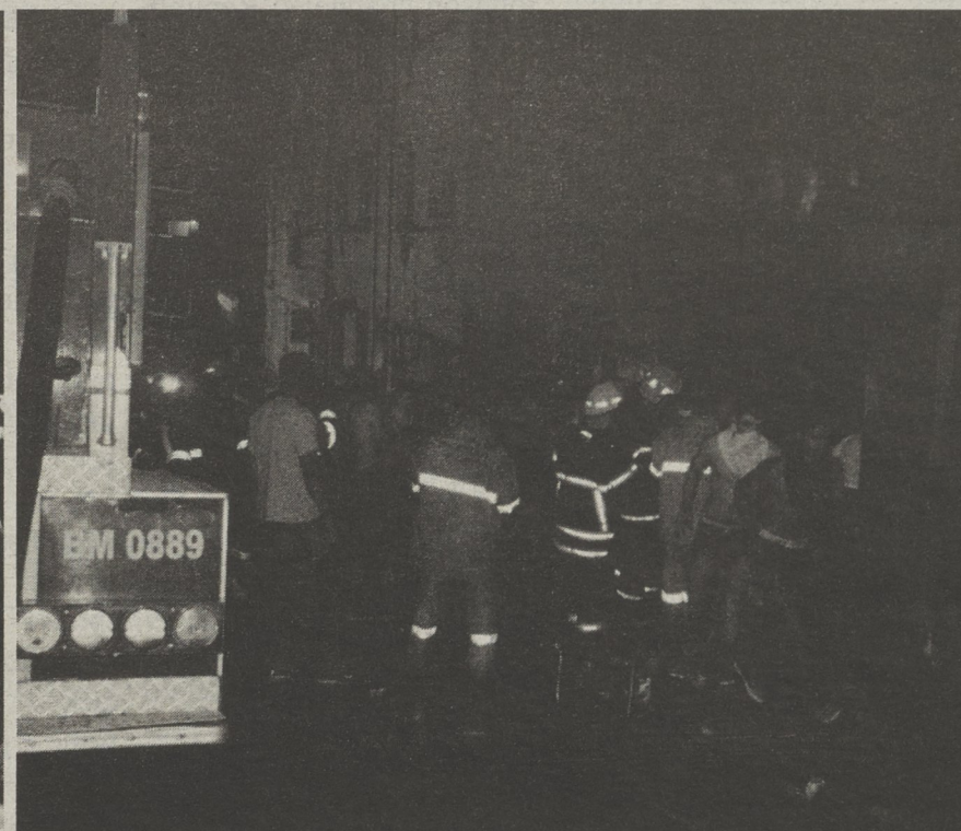
Left: Survivors huddle outside the charred nightclub. Right: Rescue workers scramble to assess the situation.