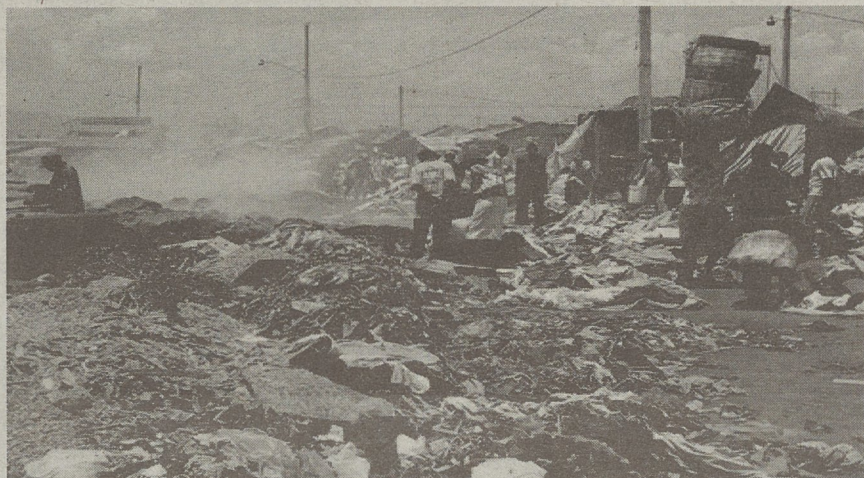
Tragedy in Haiti