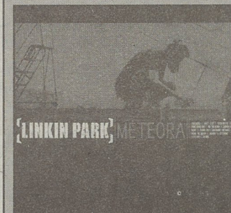
Meteora - 2003