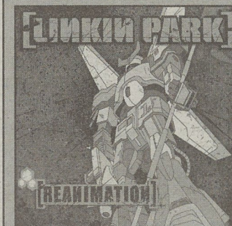
Reanimation - 2002