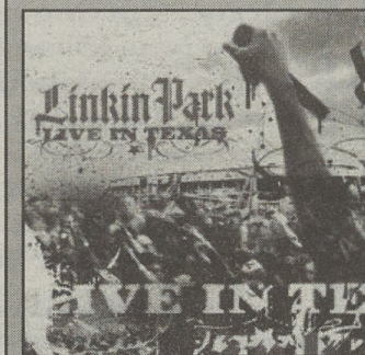
Live In Texas - 2003