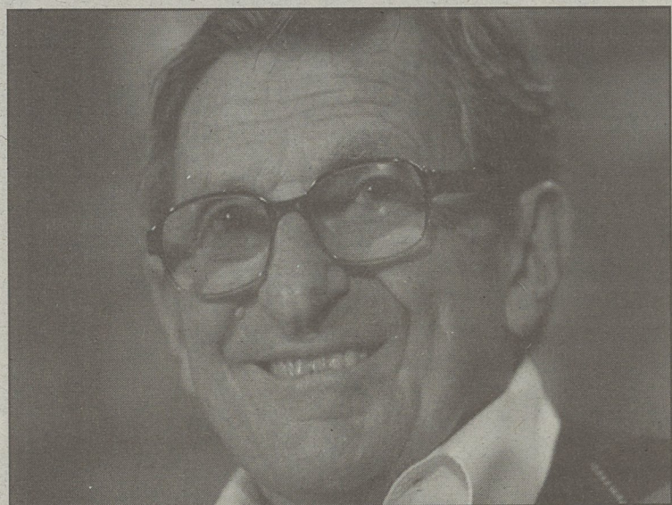
Joe Paterno speaks at his first press conference in weeks. Despite recent health problems, Paterno, 79, still manages to crack a few smiles.