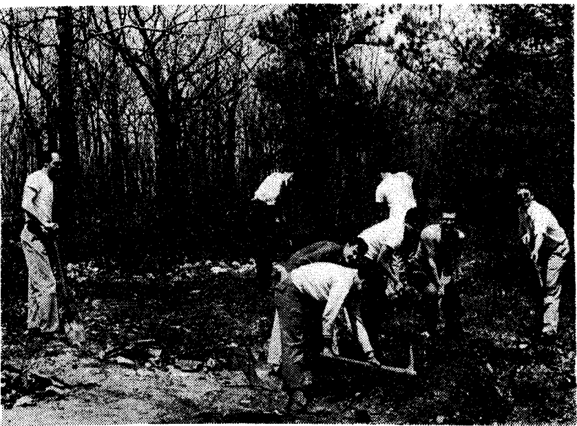
Picks and axes were flying, trees were chopped down, and debris (dead leaves, namely) was removed when the faculty and students housecleaned the campus.