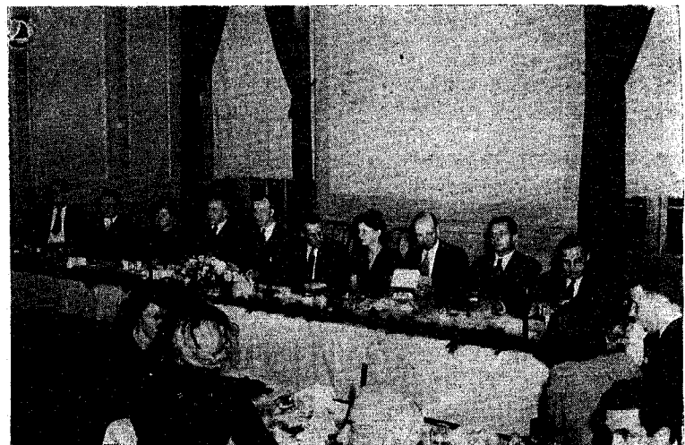
FACULTY BANQUET at Genetti's at which members of our faculty dined with Campus dignitaries. They were entertained by the Glee Club of this school with Christmas selections and the evening was highlighted by the appearance of Santa Claus.