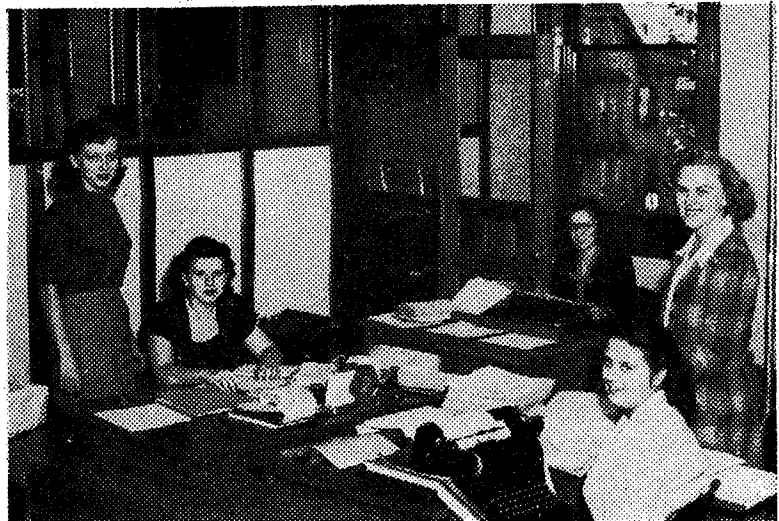
OUR CAPABLE OFFICE FORCE AT WORK —Their untiring efforts are responsible in a large way for the capable execution of administration. The overflow enrollment, and the need for speed in much of their work is an added reason for awarding plaudits to this group.