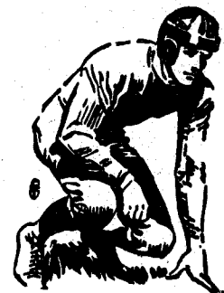
(Favorites in CAPS)

HAZLE TOWNSHIP -Mining and Mechanical Institute—Township will hand the Preppers their fourth successive setback.