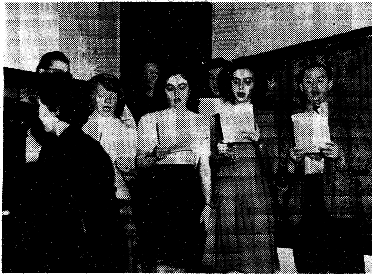
A few members of the Glee Club gather around the piano for a good old fashioned song-feet. This year the choiristers expect to set a new record high in achievements.