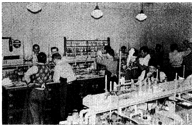
Scientists at work. Atomic research, no doubt.