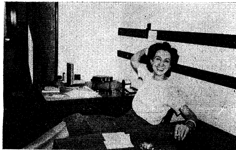
Our music instructor.

Girls whose beauty gets them hired Often find that's why they're fired.