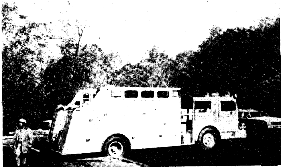
One of the firetrucks that responded promptly to the alarm triggered by the mishap in the Kostos Building.

In his radio address, Bush also said that there would be no more politics, but that he and Barbara would rededicate themselves to helping others. Certainly, one thing that Bush did well in his four years as president was to serve others. His foreign relations and foreign policy were top notch, not to mention that they brought about the end of the cold war. The efficient ways in which Desert Shield and Desert Storm were handled are commendable. In addition, the recent aid to Los Angeles after the riots and the integral role of the government in the huge relief effort still being made for the hurricane victims in Florida and other affected states, was certainly noteworthy, despite criticisms of Bush's domestic policy.