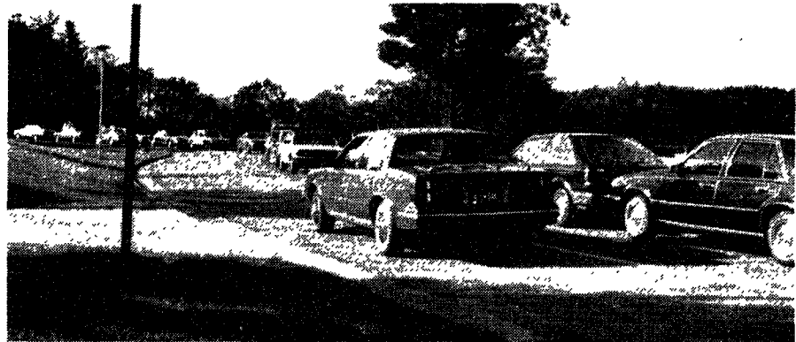
A motorist takes a risk going down a six foot wide, two way street, leaving nowhere to go if a car is coming the other way.

The parking problems don't end with off-campus students; dorm parking is also crowded. There is a small parking lot in North Dorm which cannot hope