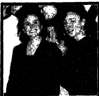
Best Buns II