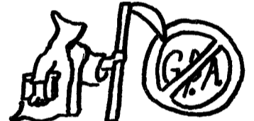
CARTOON

Beware: There is a cloaked being who lurks in High Acres reeking havoc on unaware or just plain "bad" students' G.P.A., aka, "The Grade Reaper!!"