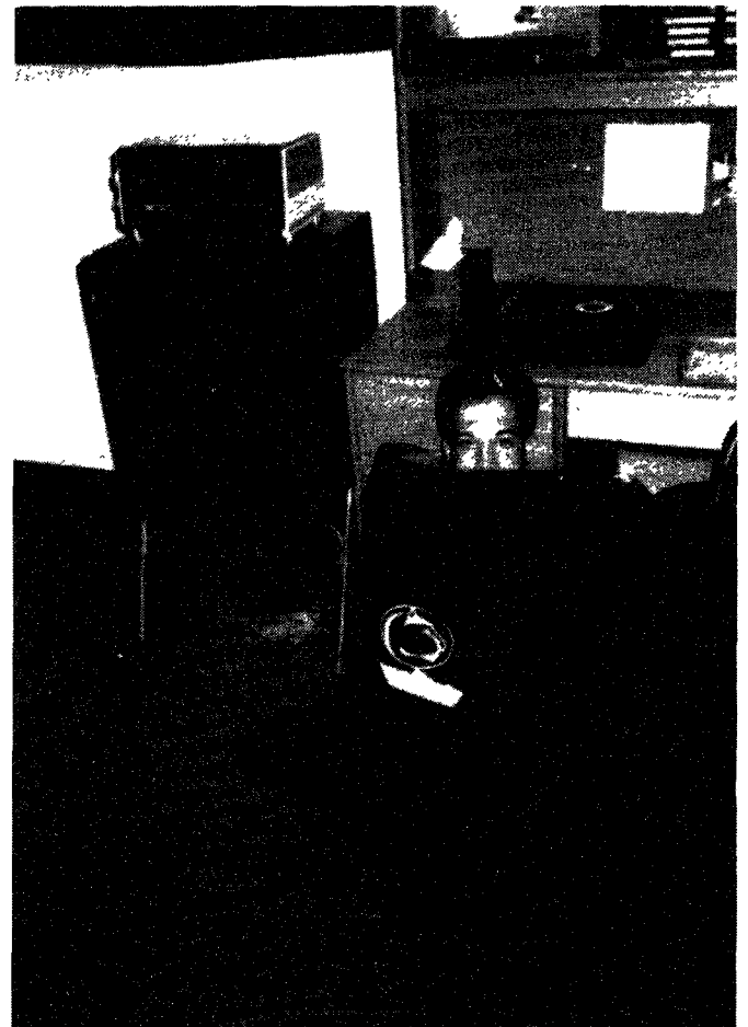
Who left this bag of birds**t in here?

SEE YOU NEXT MONTH! AND UNTIL THEN REMEMBER... THE MORE YOU PUT INTO SOMETHING THE MORE YOU GET OUT OF IT.