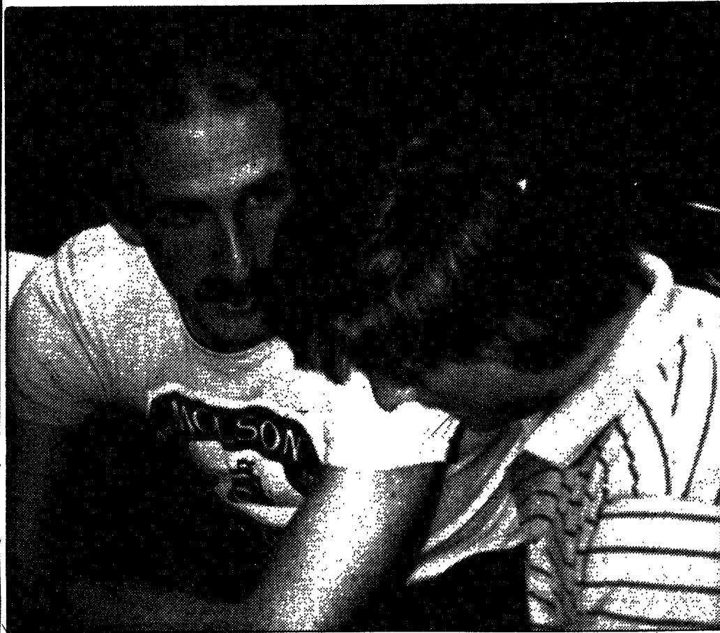
The Highacres Collegian May 1982

students from all over. Of all the things that I could think of that would drastically change the overall atmosphere of the campus, I would like to see the faculty, staff, and students all become more involved with campus life outside of the classroom. We tend to sit around a lot and complain about the lack of cultural and social activities, yet when one looks at the people who do take advantage of the special events, it appears that the same people do everything. If you are one of the individuals who can find the time and energy to become involved, my hat is off to you. If you are one of the complainers, start spending your energy in a more fruitful and positive way. Your participation and involvement would not only give you satisfaction, but it would have a significant impact on enhancing the quality of participation that the others have.