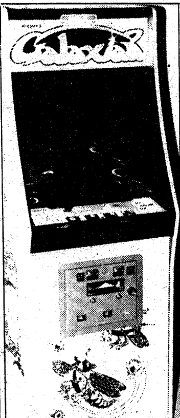
Damaged Galaxian machine in residence hall game room.