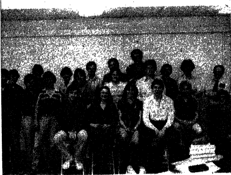
Farewell from the EET's Class of 1980