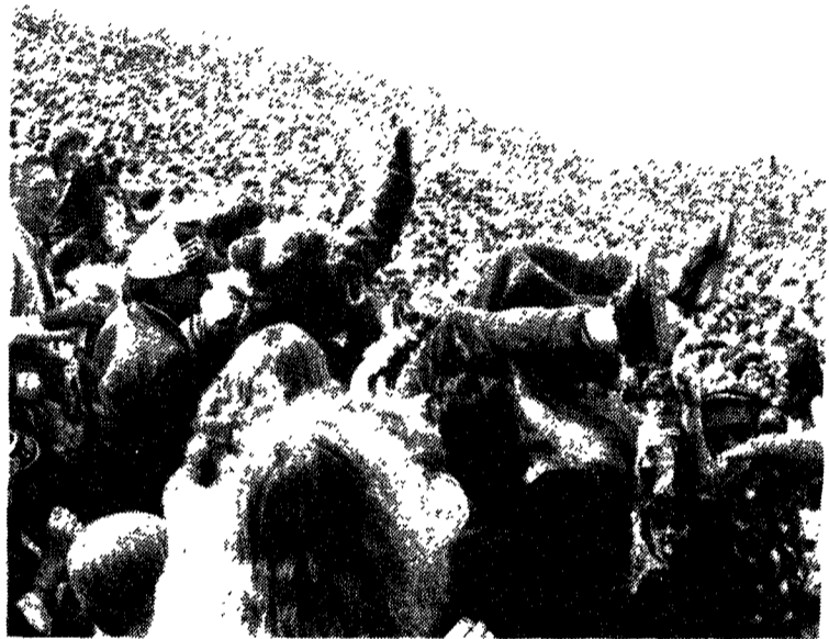
King of the Jungle is mobbed by natives.