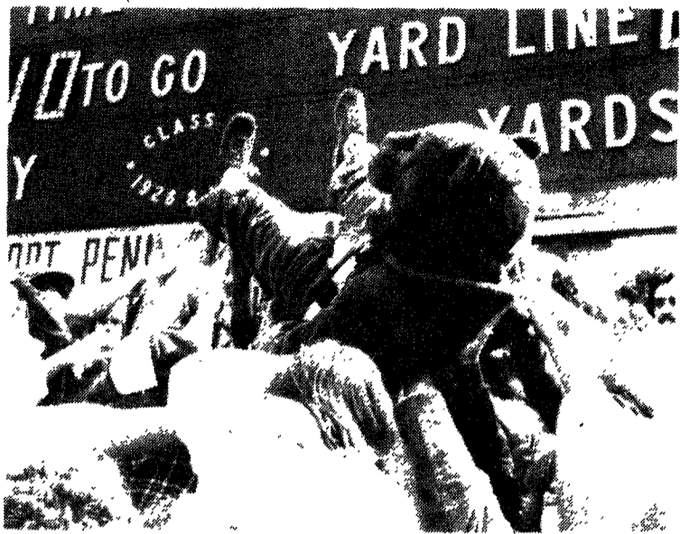
Hands off the suit, fellas!