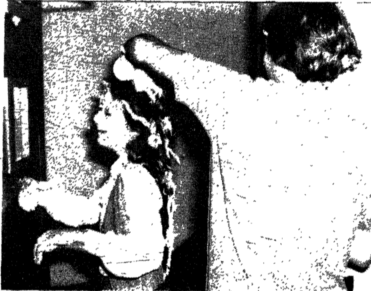
Don't forget the cherry!