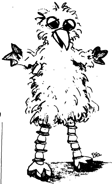
Drawing done by Bob Geffert

RB- I want your body (Of course I love you for your mind!) 454.