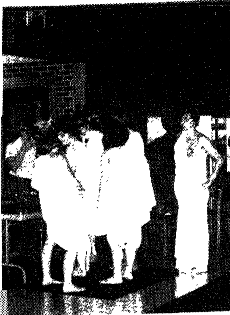
Toga disco a success

We speak of the "Average American" but perhaps what is most wrong with our nation is that too many Americans are only average.