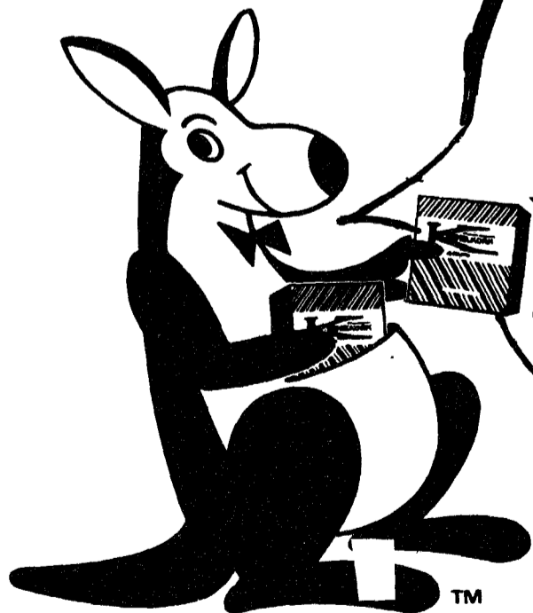
"Korny" the Karmelkorn Kangaroo