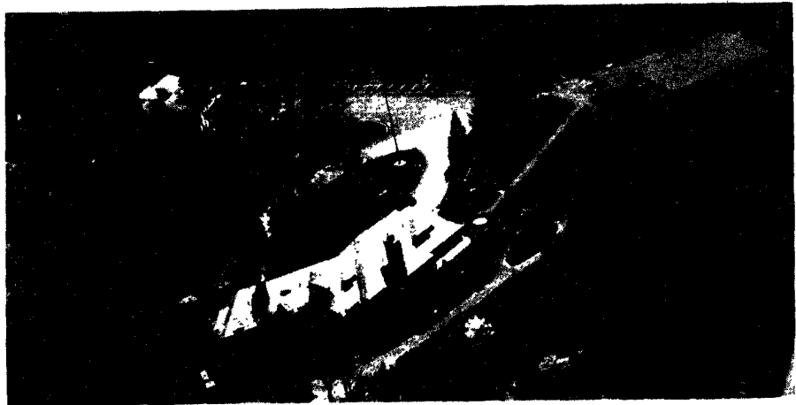
AIR VIEW OF THE HAZLETON CAMPUS