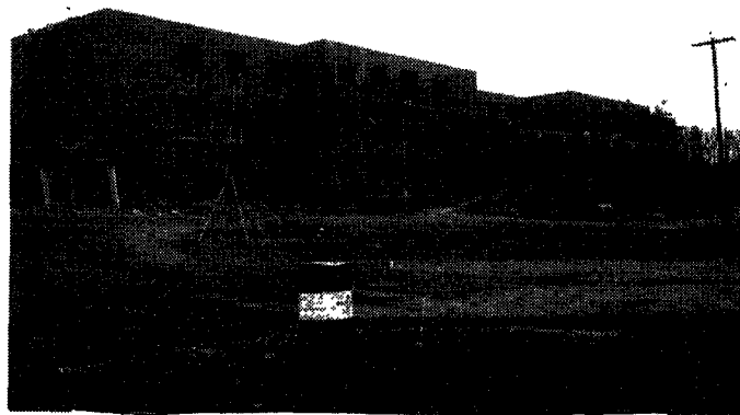
Construction of the Residence Hall