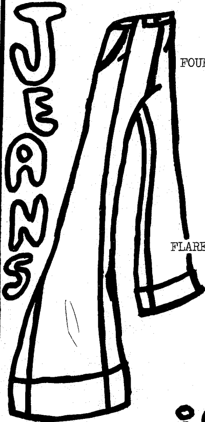
FOUR BUTTON FLY