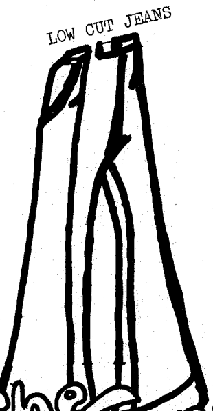
LOW CUT JEANS