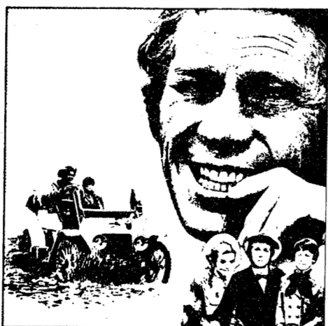
STEVE McQUEEN in "THE REIVERS"