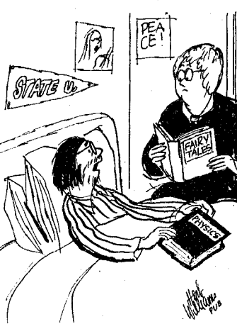
"Frankly, mom, I think it's time I read myself to sleep."

Starts Jan. 1st 'M.A.S.H.' Regions Lowest Prices Children & Students $7.50 Adults $1.00