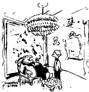
"No more silly questions about affluence, Reggie! Take your Christmas money and run along to Europe like a nice boy."

Right about now the hunter's blood circulates a little faster. The main target of every hunter during this season is the white tail deer. Every big game hunter's dream is seeing a big deer with "at least eight or ten points" walk into his line of fire.