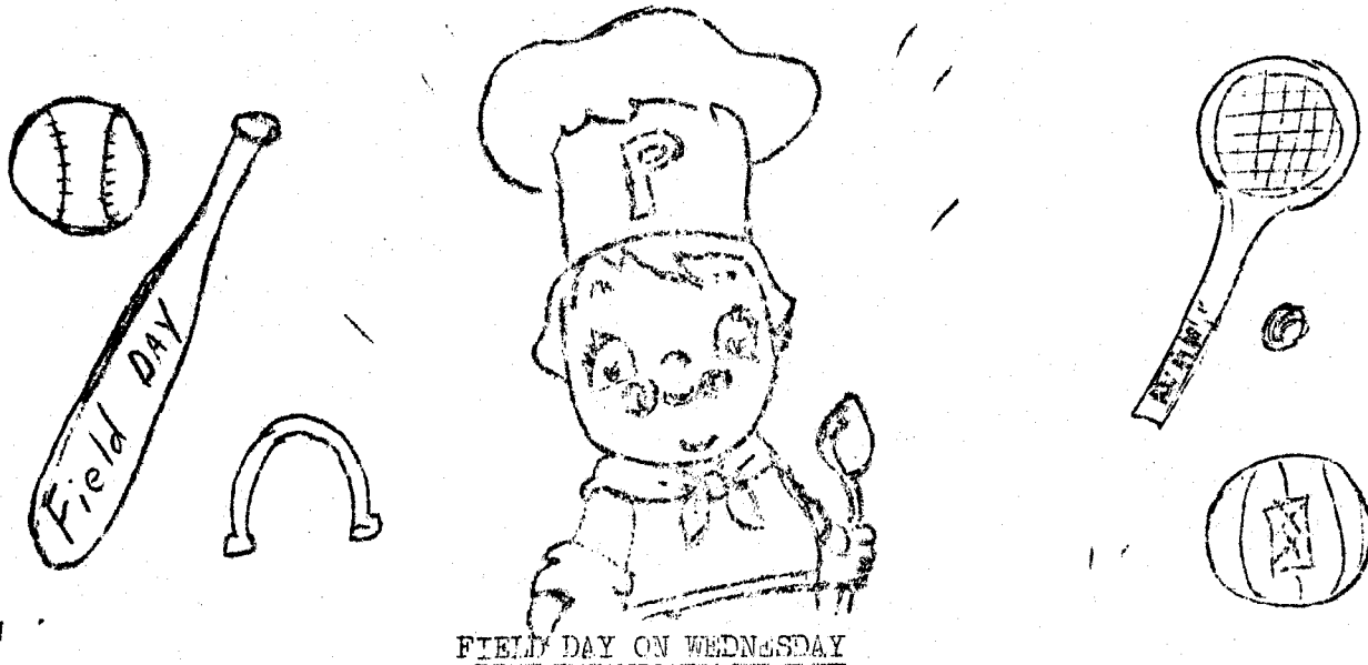
FIELD DAY ON WEDNESDAY

This year, the House Rules Committee is inaugurating a combination picnic - field day which will be held on Wednesday afternoon from 3:00 pm until 7:00 pm. Bar B-Q, hotdogs, a fifth of birch beer, chips and all the other goodies that go with a picnic will be on hand for all students and faculty. Baseball, basketball, football, quoits, volleyball and other sports equipment will be available to make the day complete. Everything will be free to eat and use, so make plans to attend. This affair will be similar to our orientation week picnic.