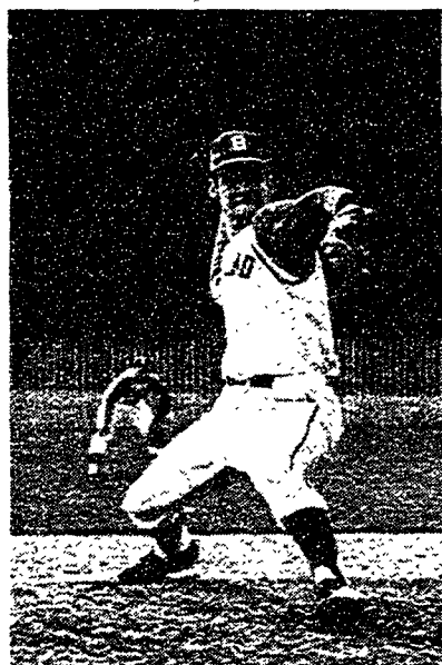
Rich Schroeder hurls in relief against Altoona.