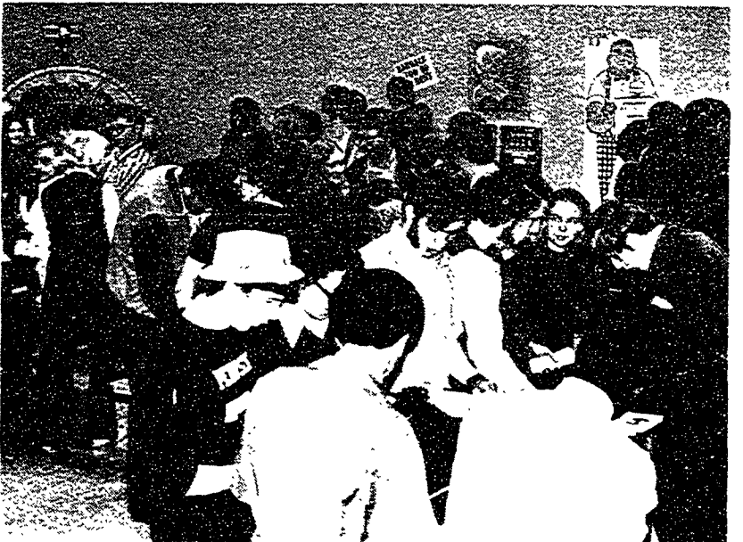
A Legal Night of Gambling

The possibility of a Board of Directors and elected group of officers was discussed and a final decision on these subjects will hopefully be reached during an upcoming student marshal meeting. The philosophy of this group will be determined at this time.