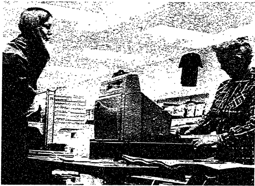
A student awaits her change as necessary books are purchased for yet another term.