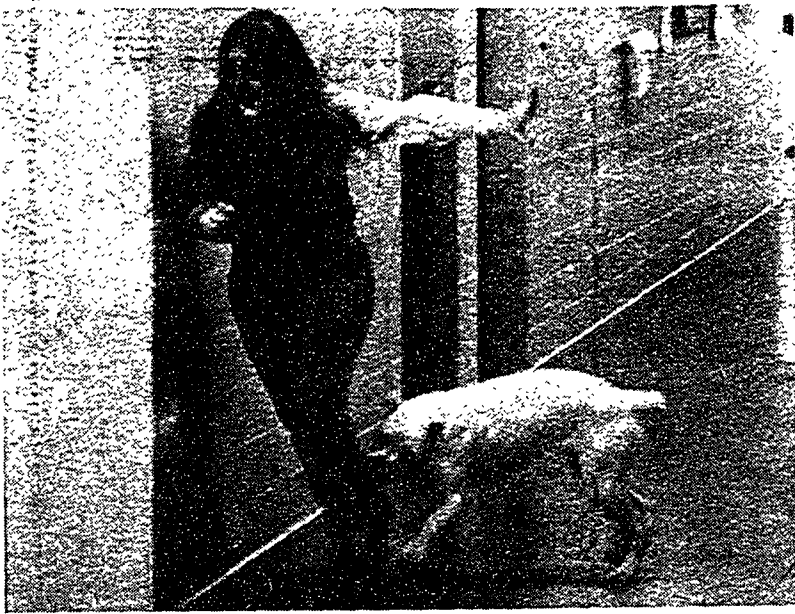
"Snow" loves everyone!