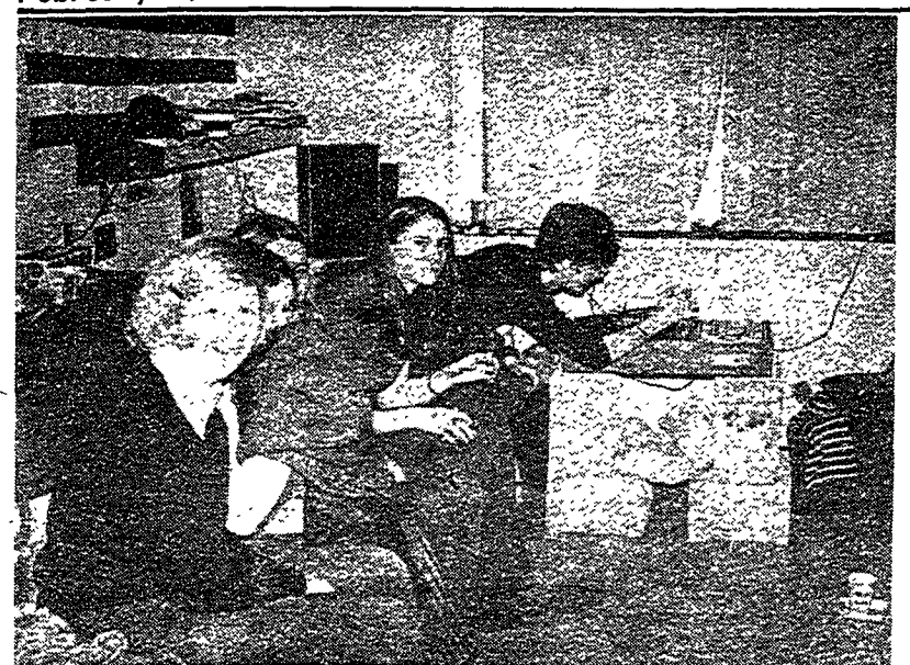
Student intervisitation in "Full" swing.