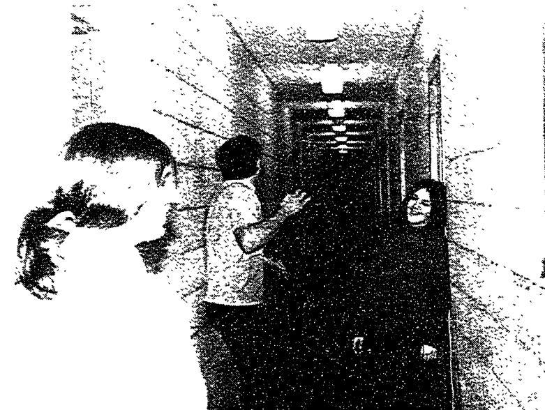
Student escorts insure contenuation of visitation program.

Cool Hand Luke will be shown on Saturday, February 20 at 7:00 p.m., and Sunday, February 21 at 7:00 and 9:15 p.m. in the R.U.B.