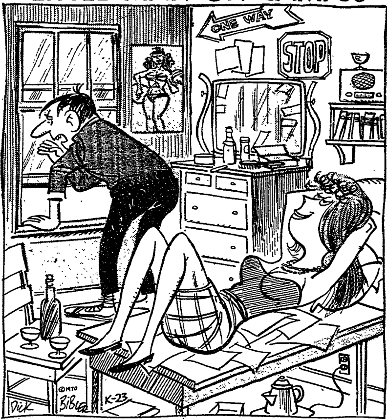
"I'D LIKE TO GO WITH YOU GUYS, BUT YOU SHOULD SEE TH HOMEWORK I'VE GOT STACKED UP ON MY DESK."