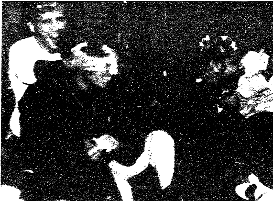
Orientation for Frosh?!?