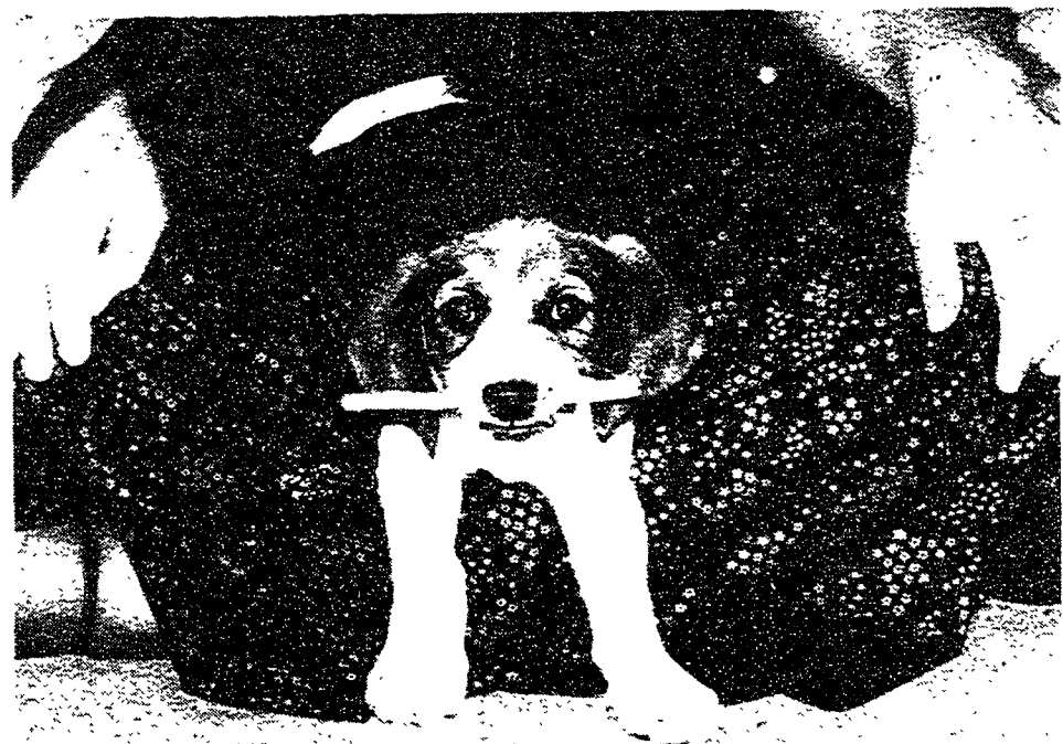
"Don't you dare O.B.!!"