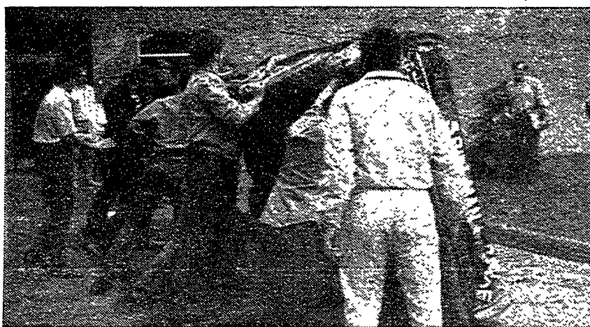
WRECKED? Not really. Behrend students take out their frustrations at the CAR SMASH.

The team record as of Wednesday, May 27, 1970 was 3-5. The tennis season ended Saturday, Memorial Day as the team traveled to Altoona.