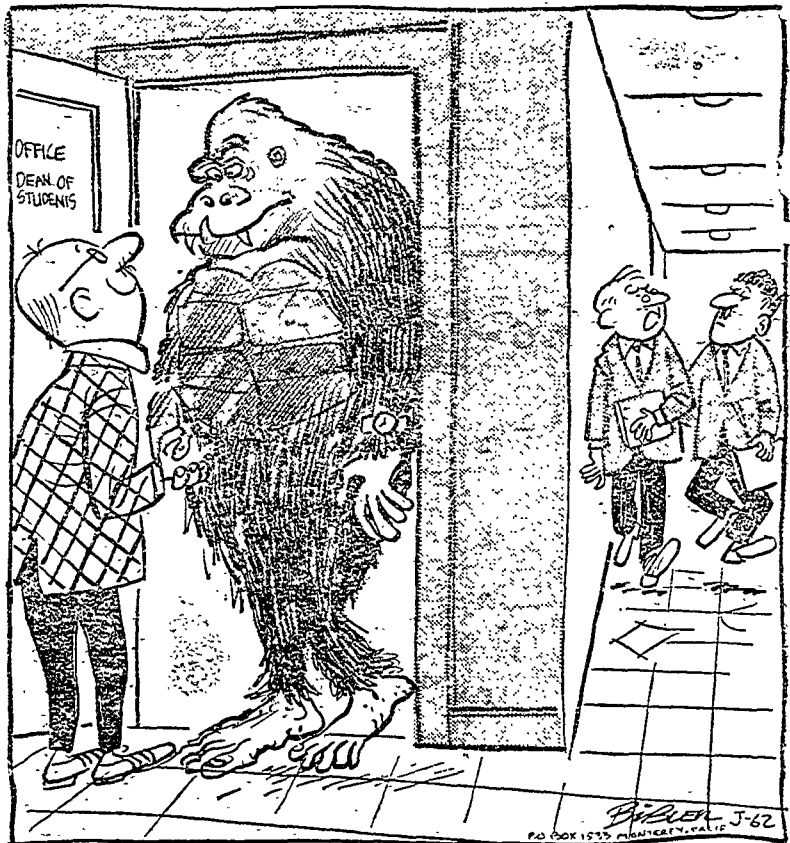
"I UNDERSTAND THEY HIRED A NEW DEAN OF STUDENTS WHO ISN'T AFRAID TO STAND UP TO TH' DISSIDENT LEFT."