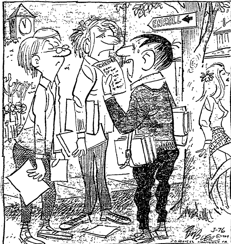
"HOW DO THEY EXPECT US TO EVER GET AN EDUCATION IF WE HAVE TO SPEND ALL OUR TIME GOING TO CLASS."

Several changes in the registration procedure are planned for March 30th final registration for spring term.