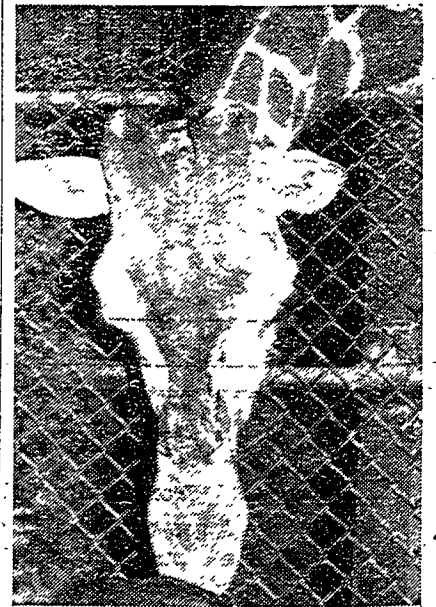
Pete the giraffe

REPRESENTED FOR NATIONAL ADVERTISING BY National Educational Advertising Services A DIVISION OF READERS DIGEST SALES & SERVICES, INC. 360 Lexington Ave., New York, N.Y. 10017