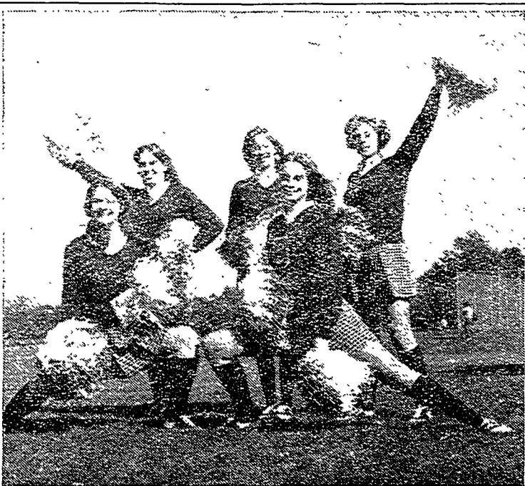
Here's the pin-up for the week, our cheerleaders.