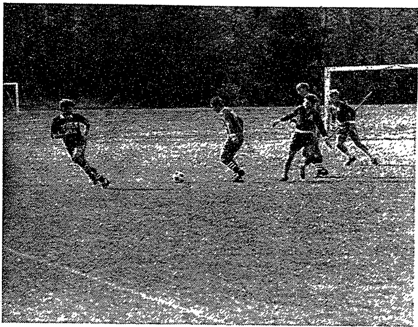
Here's Behrend on the defensive against Alliance in Wednesday's contest. We won 3-2 in overtime play.