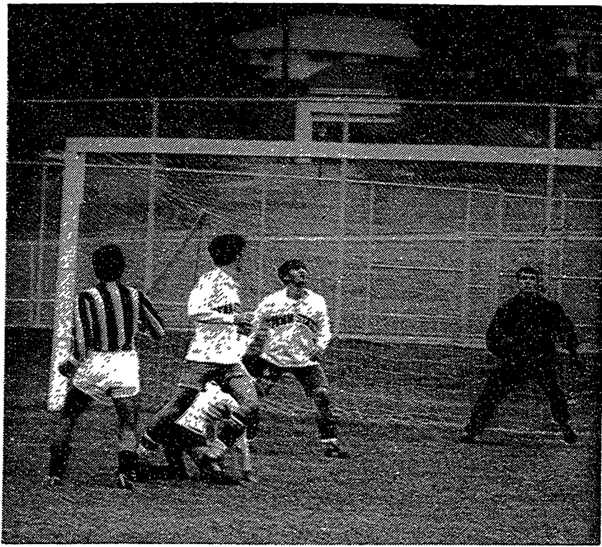
Behrend's soccer team in scrimmage against Gannon.