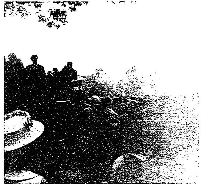
Kennedy speaks to Washington D.C. crowd.

Senator Kennedy feels that we should help any nation that is willing to make a definite effort to help itself. Domestically, Kennedy feels that the problems of race riots and crime can be best solved by strict social reform. He sums it up by saying, "I run for the presidency because I want the United States to stand for hope, for reconciliation of men, for new polociies."