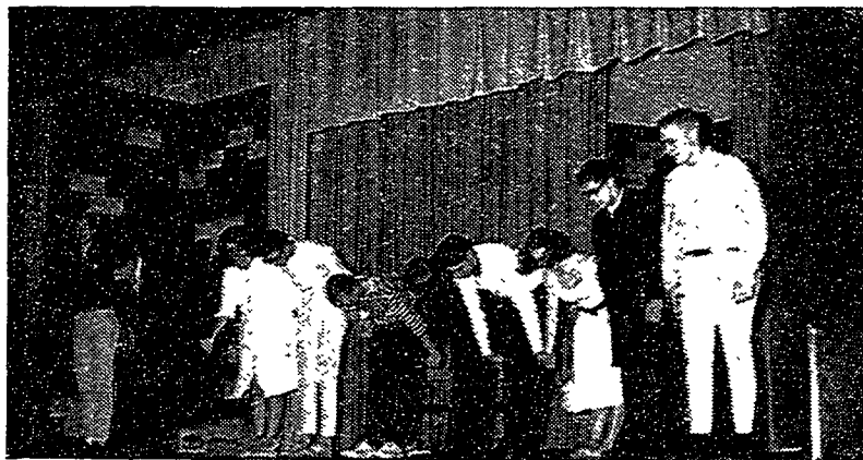
The Behrend Players