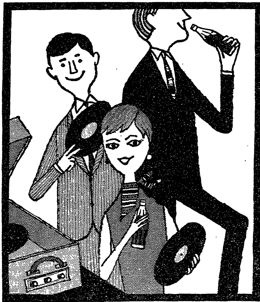
"COKE" IS A REGISTERED TRADE-MARK, COPYRIGHT 1957 THE COCA-COLA COMPANY.