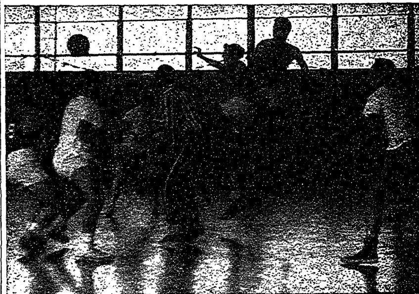
A scene from the fast-moving basketball game between the Behrend Center boys and the Alumni on Homecoming Day. The Alumni copped the game 27-21, but not without a good showing by our home team.