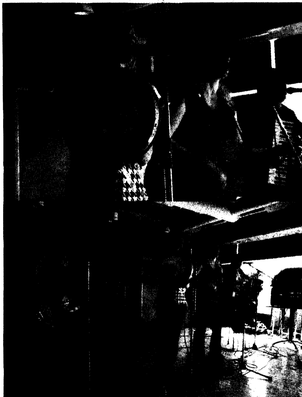
Pictured above is the band Screaming Orphans during their performance on Tuesday during common hour.