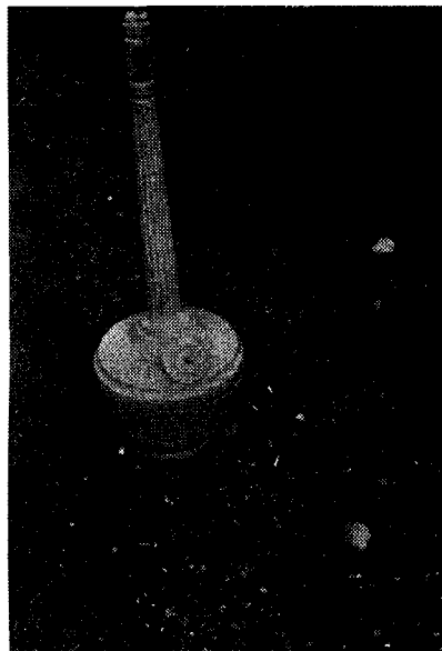
Pictured is one of the cigarette butt bins which smokers seem disregard. A number of butts can be found on the ground.

This week's “What The Foto” is dedicated to littering on campus. Don't be a litterbug. Pick up after yourself, it's your campus too.