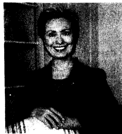
Hillary Rodham Clinton: